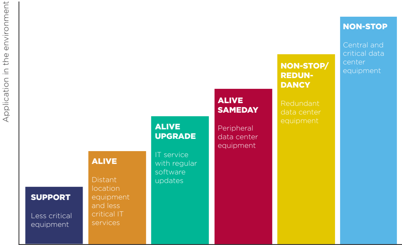
NIL Assist regimes