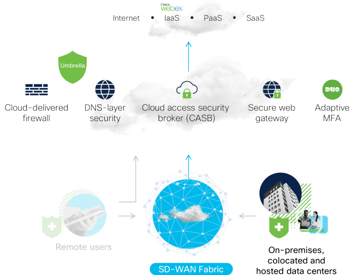
Figure 3: Cisco SD-WAN enabled branch architecture.

Automate deployment of cloud security across your SD-WAN fabric to thousands of branches and instantly begin protecting against threats. Secure and connect users over any transport to any cloud with a simple and intuitive onboarding to SASE. Cisco SD-WAN delivers automated tunneling through one-click, full-mesh VPN between all branch locations so you can scale up or down with ease. End-to-end security segmentation honors enterprise intent and provides branches with secure connectivity to everything they need: from on-premises and colocated facilities to integrated cloud services ranging from AWS to Azure, and more.