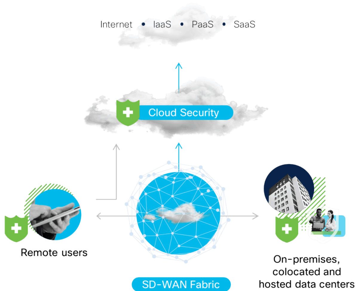
Figure 1: Cisco SASE architecture.

Cisco Secure Access by Duo ensures users are who they say they are, and devices are healthy before establishing the connection.