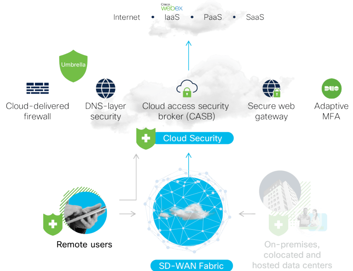
Figure 2: Cisco secure remote access architecture.

Umbrella provides secure connectivity in a single push with a single policy, all part of the most comprehensive cybersecurity platform in the industry.